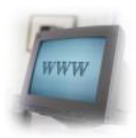
Sign Up Now!

Many of you have already received your 2005 tax refund via E-file. As of February 13, most 2005 returns will be E-filed. This means that refunds are processed as fast as 5 business days compared to 1-2 months on the paper system. I always recommend being set up for direct deposit so there is no need to wait for a check. All you need is the information for your bank account or a blank check to set this up. If you have already filed your return, you can fill out the Direct Deposit form and send it into CRA . If you haven't signed up for an e-pass, I suggest you do. It is the way of the future for taxes and for all of your dealings with the government. I would not be surprised if it was manadatory in ten years. If you need any help, call the help desk at 1-800-714-7257.