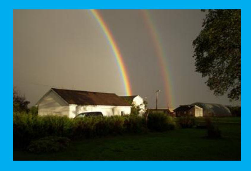
"Caught this shot over the barn 2 summers ago"